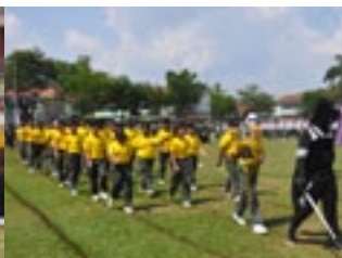
Characters from Star Wars leading 2K in the march past.