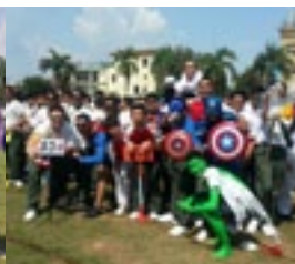
Superheroes invaded the SFI field.