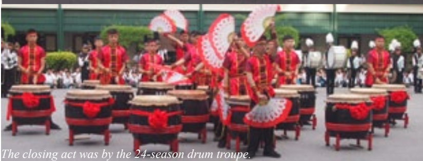
The closing act was by the 24-season drum troupe.