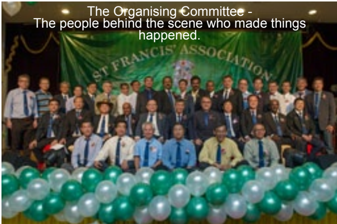
The Organising Committee - The people behind the scene who made things happened.

January 2, 2016: The SFA Annual Dinner has without fail attracted good attendance. This year's event was co-organised by Class '77.