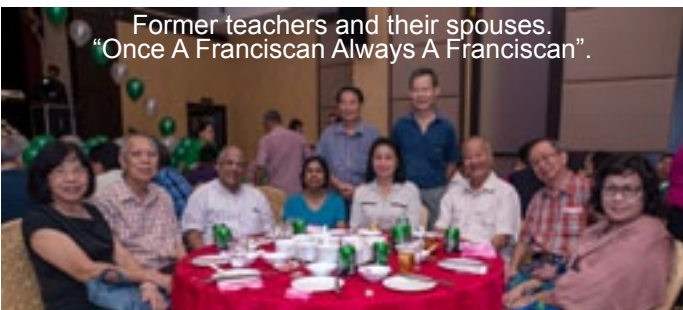
Former teachers and their spouses. "Once A Franciscan Always A Franciscan".