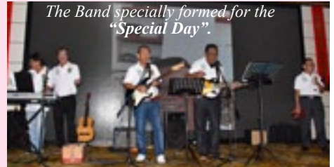
The Band specially formed for the "Special Day".