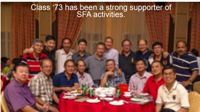
Class '73 has been a strong supporter of SFA activities.