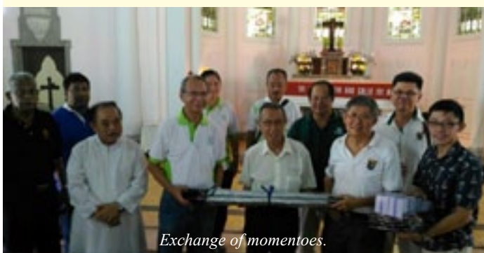
Exchange of mementoes.