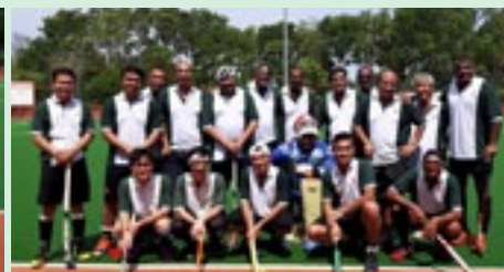
The Team from St Paul's Institution, Seremban.