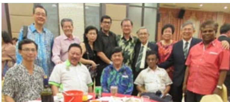
Members from the Lasallian Family at the SFA Dinner. May the Lasallian Spirit Lives On!