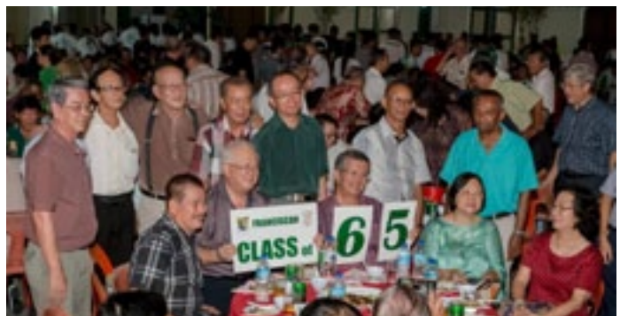
"Friendship is not about whom you have known the longest, it's about who came and never left your side". Franciscans Class '65 came with their spouses.