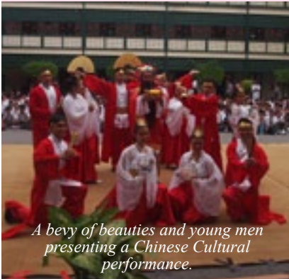
A bevy of beauties and young men presenting a Chinese Cultural performance.