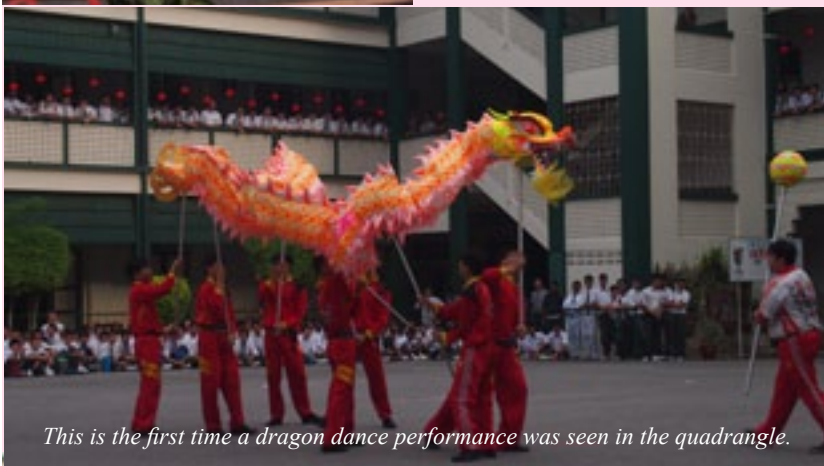
This is the first time a dragon dance performance was seen in the quadrangle.