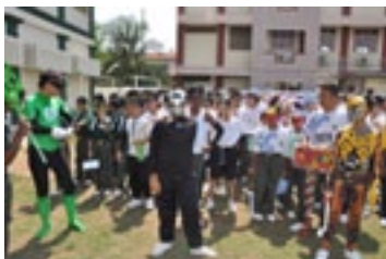
Green Lantern, Iron Man and Bumble Bee.