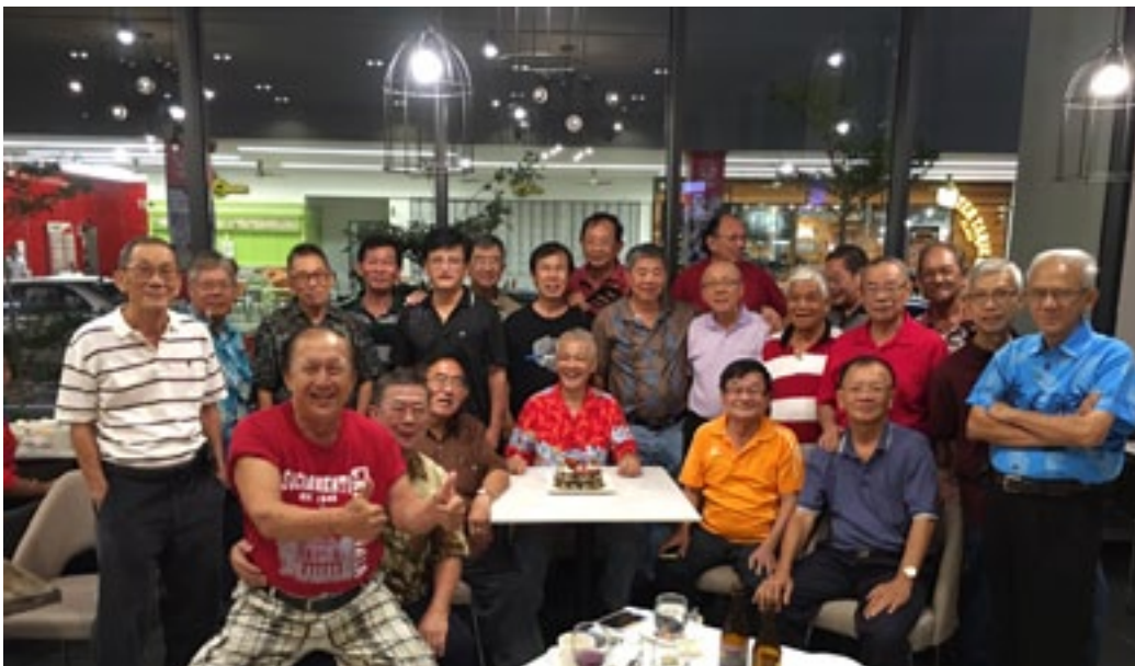
At the Pines Hotel, Malacca on April 1, 2016.