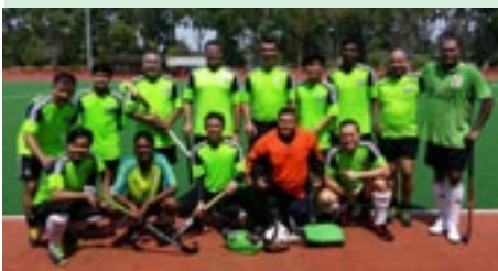
The Team from St John's Institution, Kuala Lumpur.