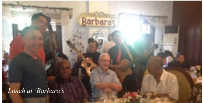
Lunch at 'Barbara's'