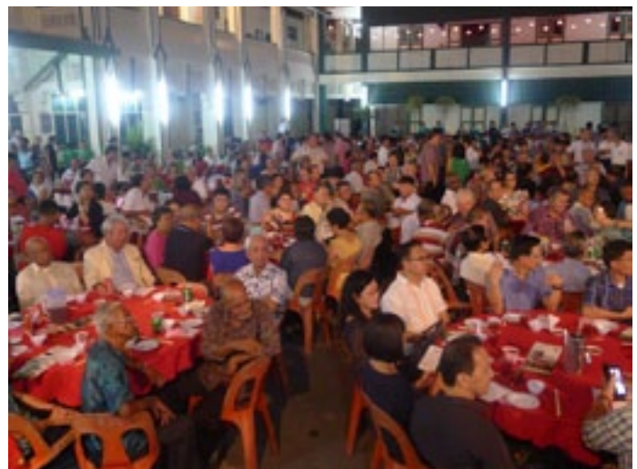
The atmosphere on the School Quadrangle was very vibrant