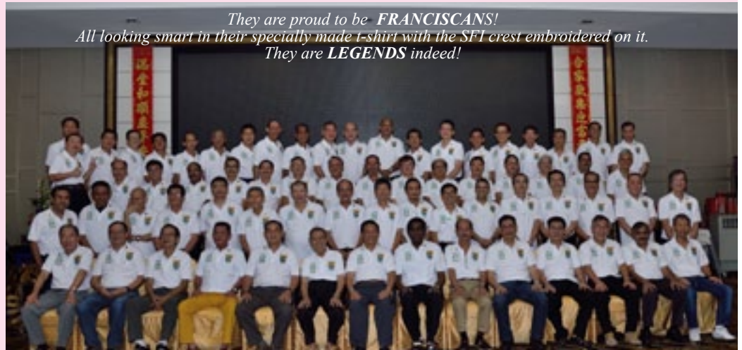
They are proud to be FRANCISCANS! All looking smart in their specially made t-shirt with the SFI crest embroidered on it. They are LEGENDS indeed!