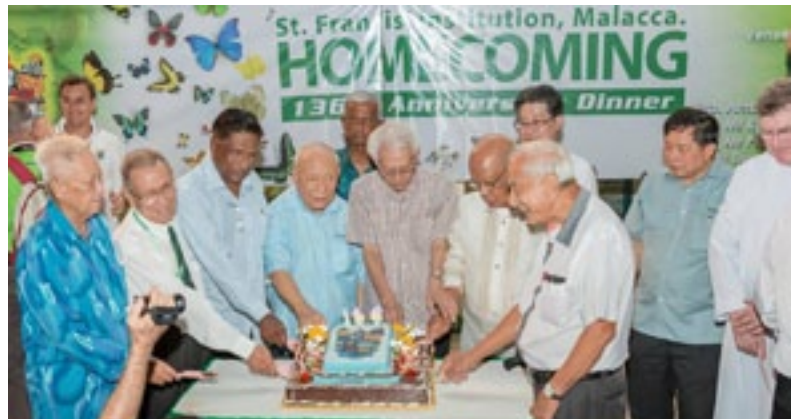
Pic on the right: Senior Franciscans, age 80 years and above, joined the La Salle Brothers with the cake cutting.