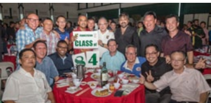
"The warmth of a friend's presence brings joy to our hearts, sunlight to our souls and pleasure to our life". Thumbs Up! And Peace be with YOU! That's what seems to be in everybody's mind.