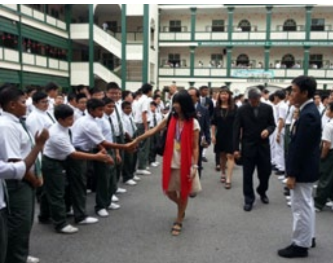
Students wishing her farewell in the School Quadrangle.