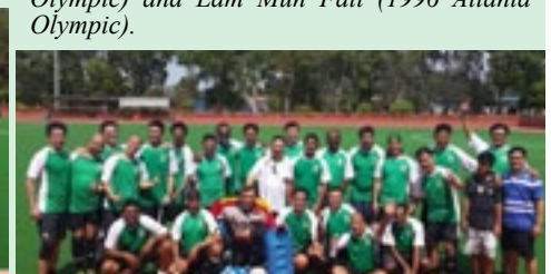
SFI came with a big squad.