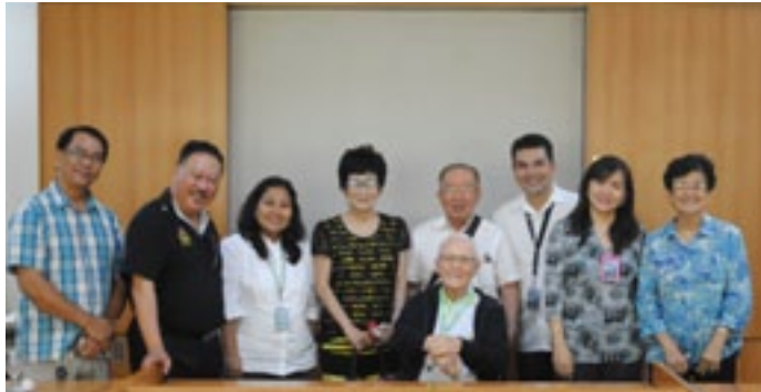
At the DLSU Science and Technology Complex situated on a secured 50-hectare campus in Laguna. The DLSU Science and Technology Complex is envisioned to become a key resource for scientific advancements and technological innovations in the country, underscoring the Lasallian tradition that integrates faith and service through knowledge generation.