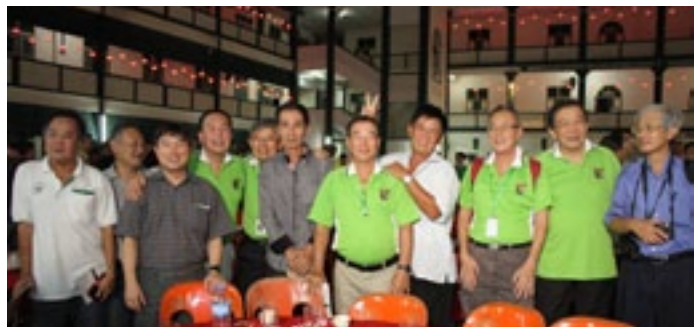
You can count on them. Franciscans Class '70 have always been very supportive of any Franciscan events.