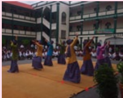
A Melaka Chitty performance by the 2015 KAYAF dance troupe.