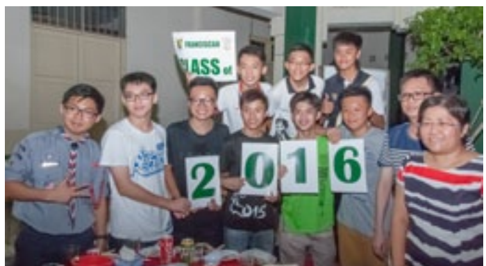
We are the young ones!!! It's our first Homecoming Dinner and we hope for many more dinners to come. We are ready to receive the 'baton' and continue to carry on the Tradition and Legacy of Franciscans!