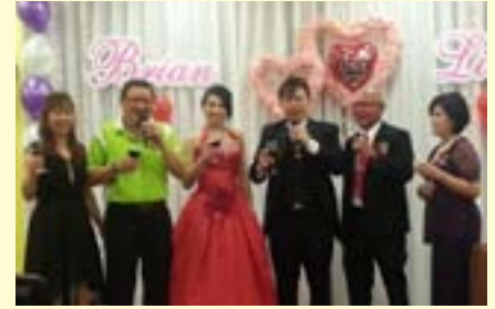
The Yongs and the Lims. A New Happy Union.