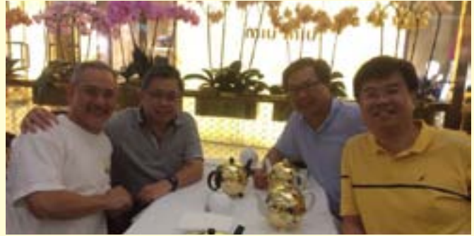
The inaugural Singapore gathering. It only just began...

The greatest SUCCESS for us all is to be able come together to share our life stories, our hardship, our sadness, our joy, our laughter... But we have not forgotten the Franciscan Spirit we learned and will always treasure those memories we had together in school.