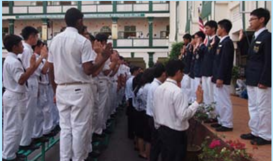
The newly-installed prefects taking their oath of office