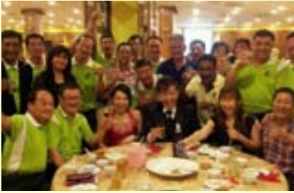
The bride and groom with Franciscan Class '77