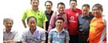
Class '77 at one of their regular gatherings

There is always an occasion for us to meet