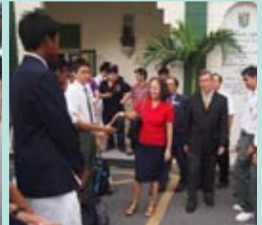
Present and former students wishing her a happy retirement.