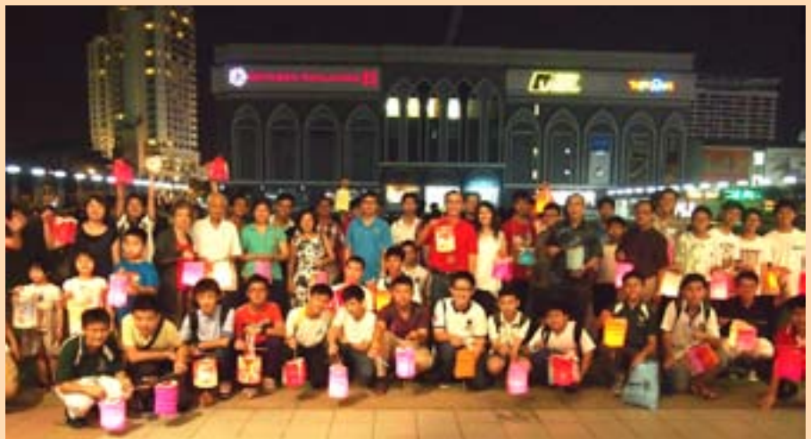
A group photo taken at Dataran Pahlawan. An event everyone can join in regardless of their age.