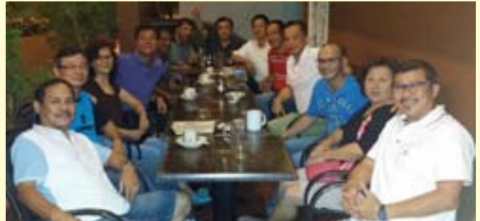
The group in Malacca. We are are growing...